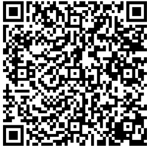
QR Code for Active Members