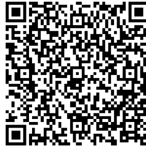
QR Code for Emeritus Members